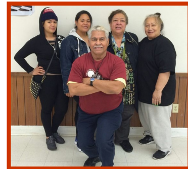
New Instructors and Assistants, Pacific Asian Empowerment Program ( PAEP )

"YOUR LIFE DOES NOT GET BETTER BY CHANGE, IT GETS BETTER BY CHANGE."